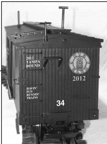
View of graphics on back of engineering car.